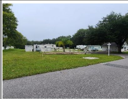
RV site on Range Lane being upgraded for easier RV access.