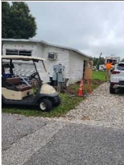
Another trailer in the process of being removed and the site will be upgraded for a short-term/annual RV site.