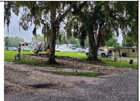
Old trailer on Rambler was removed and site is being upgraded for short-term/annual RV site.